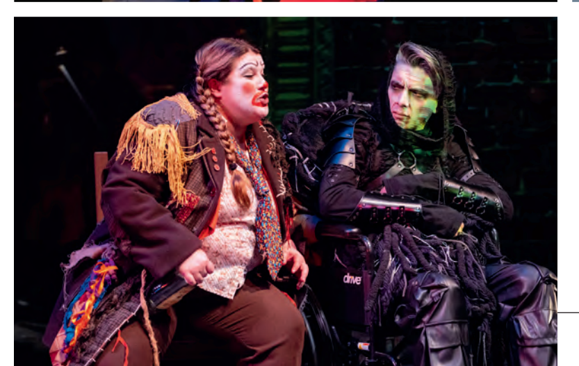
Facing page: Scenes from The Magic Flute This page (clockwise from top): Two scenes from Alcina and two from The Emperor of Atlantis